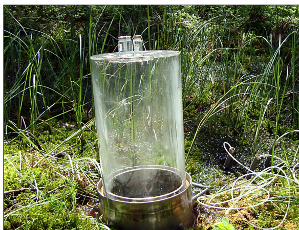
Fig. 2. Chamber technique for collecting gases samples in situ

In situ methane emission rates from the selected points of Moszne peatland were analyzed in 2011 in three growing seasons (spring, summer, autumn) in order to determine the influence of temperature and plant cover on methane fluxes. Samples of gases emitted from the surface were collected during stationary measurements using the chamber method [11]. The sealed chambers were set in the tested points (Fig. 2). The gases were delivered through the rubber septa placed at the top of the chamber using a gas tight syringe and transferred to the vented vials (20 ml). The triplicate gas samples were collected after 0 (control), 30 min and 60 min. Concentration of CH 4 was analysed using gas chromatograph (SIMADZU, GC 2010) equipped with a flame ionization detector (FID), after CH 4 calibration. To estimate the contribution of plants in methane emissions from the Moszne peatland, in each investigated point gas sampling were conducted from the surface with the cover by native flora and after its removal.